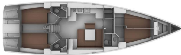
4 Cabin layout