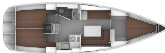
3 Cabin layout