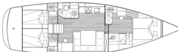
3 Cabin layout