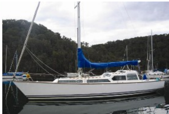
“Louee” – Adams 36 $99,000