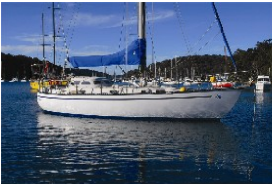
“Just Magic” - Swanson 38 $99,950